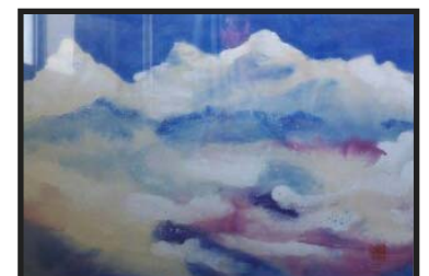
HM: Cheryl Neuenkirk