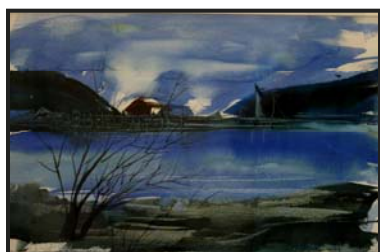
"Blue Morning" Dori Marler