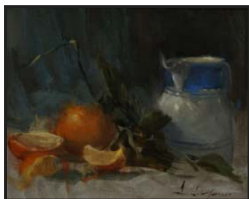
"Breakfast Oranges" Simon Addyman