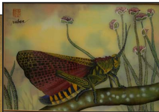
2nd Place "Grass Hopper" Ruben Yadao