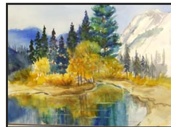
"Yosemite Reflections" Sara Coyle