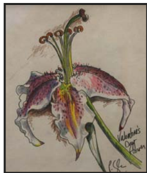
"Valentine's Day Flower" Pat Coyle