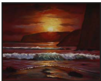
"Red Seascape" Gerda Maxey