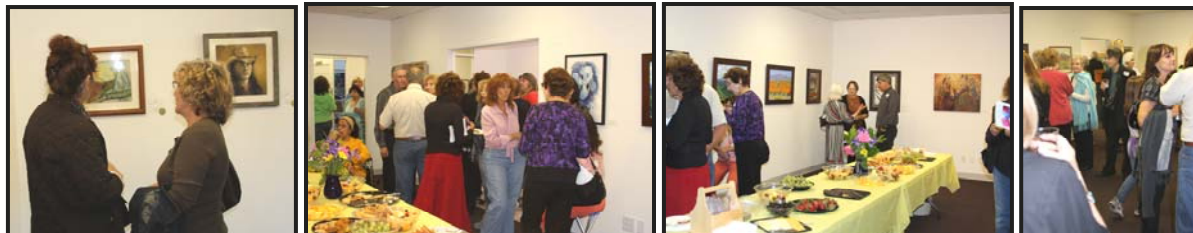
Members enjoying the SFVAC's Views and Visions reception