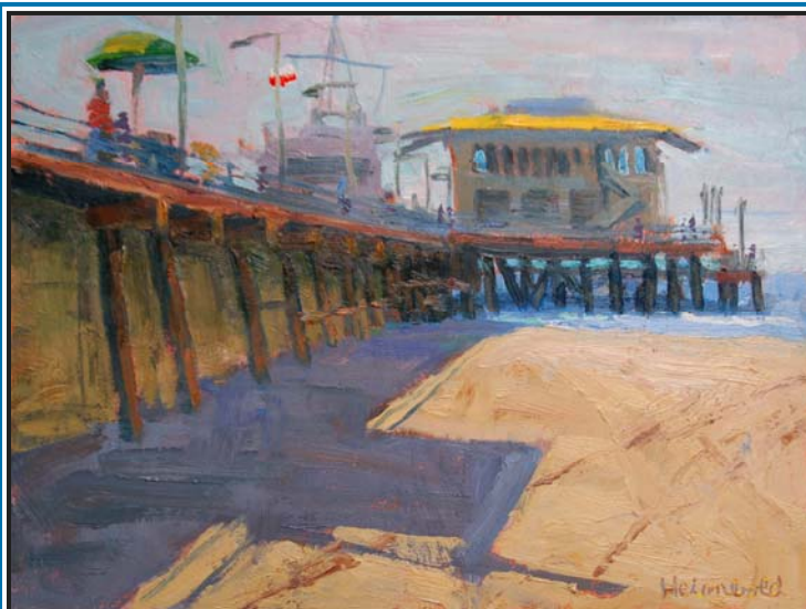
Santa Monica Pier

March 2010 Volume 66 Issue 03 Non-Profit Organization #95-604775